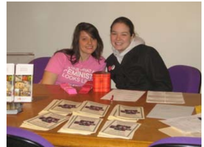
Above: Vagina Monologue tickets were on sale.