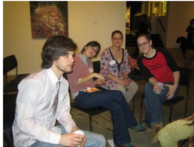
Above: Women's Project presenters visited after their performance.