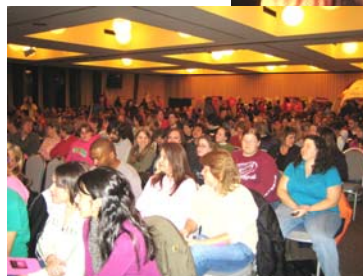
Above and left: The Vaginas played to a sold out house.