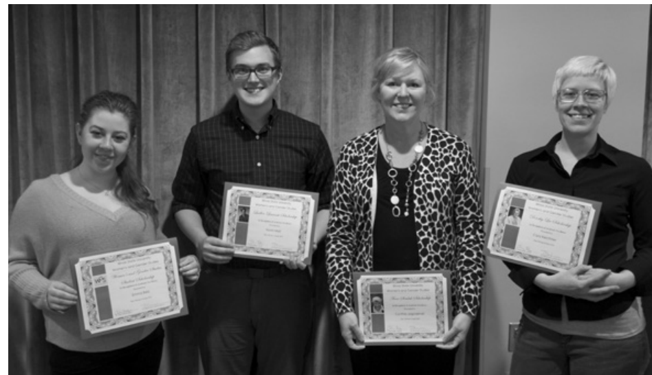
Scholarship recipients were honored at the 20th Annual WGS Symposium.