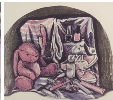
Nicci Arnold's Study in Pink and Purple